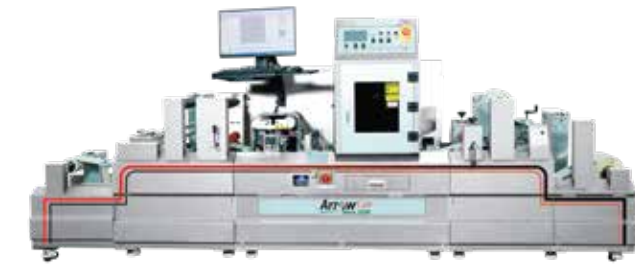
ArrowCut Nova 330R