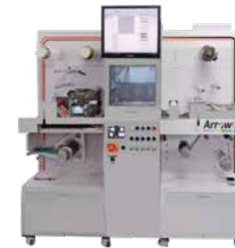
ArrowCut Nova 250R