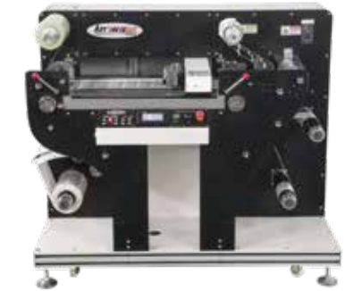
Arrow EZCut 330R