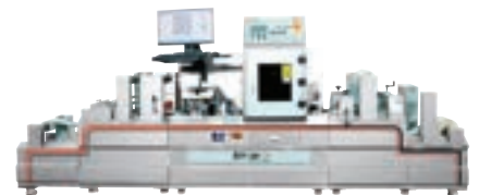
ArrowCut Nova 330R