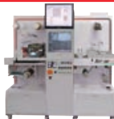
ArrowCut Nova 250R