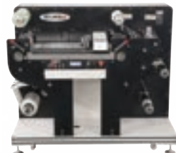
Arrow EZCut 330R