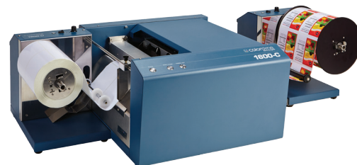
1600 Series C Benchtop Printer