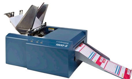
1600 Series S Sheet Printer