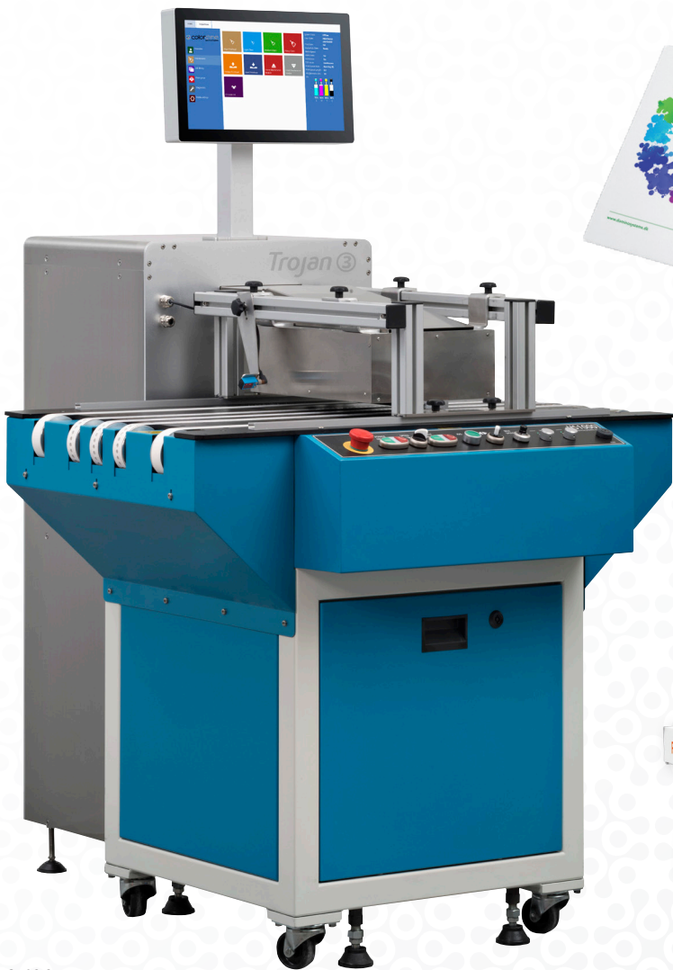
2600 Series Overprinter shown with optional mail table

The flexible positioning system allows the DPM to move up to 16 inches outward from the base for printing a wide variety of sizes and shapes. Ease of use is enhanced by automatic print head cleaning, an on-board job library, and easy access to all vital components. The system comes ready to run out-of-the-box within hours.