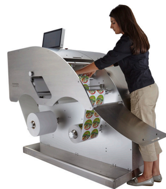
2600 Series Mini Press