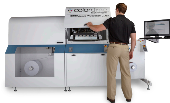
3600 Series Production Class

Let us apply our deep market knowledge to determine a flexible digital printing solution for your business to save you time and money in your operations.